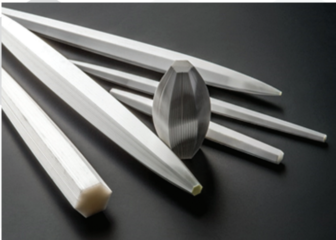
Unpackaged Polycapillary Optics

XOS is the leading global manufacturer of polycapillary X-ray optics. These state-of-the-art optics capture a large solid angle of X-rays from a source and redirect them to a micron-sized focal spot or highly collimated beam. The use of polycapillary optics can significantly enhance the performance of X-ray analysis in many applications, including X-ray fluorescence (XRF) and X-ray diffraction (XRD).