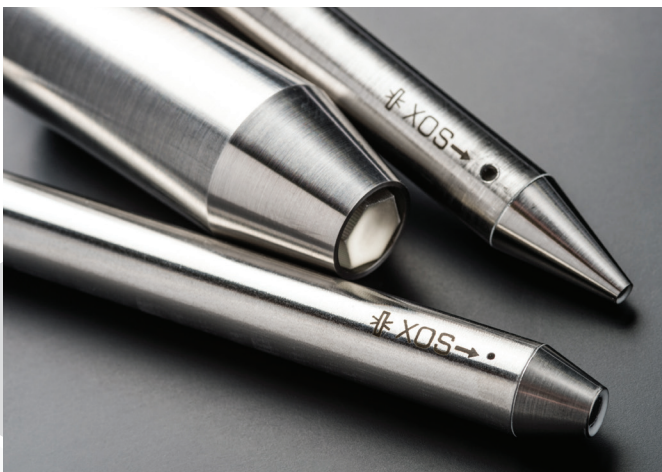
Packaged Polycapillary Optics